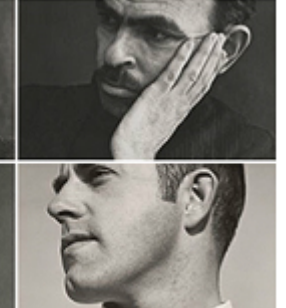
View the Inspired Vision Microsite in a new window.